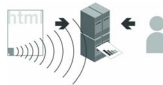
Figure 1 Schematic page tag methodology: Page tags send information to remote data collection servers. The analytics customer views reports from the remote server.

There` are two common techniques for collecting web visitor data – page tags and logfiles.