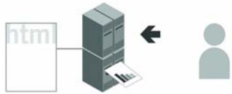
Figure 2 Schematic logfile methodology The web server logs its activity to a text file that is usually local. The analytics customer views reports from the local server.

Logfiles refer to data collected by your web server independent of the visitor's browser. This technique, known as server-side collection, captures all requests made to your web server, including pages, images and PDFs and is most used by 'stand alone' software vendors.